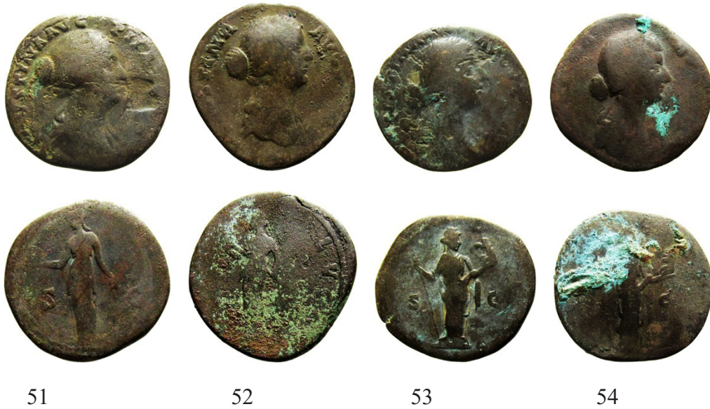
Pl. VI. The sestertii hoard found in Dobruja passim, ante 2016.