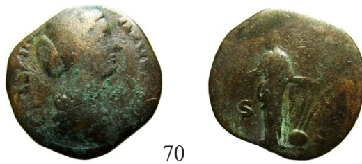
Pl. VIII. The sestertii hoard found in Dobruja passim, ante 2016.