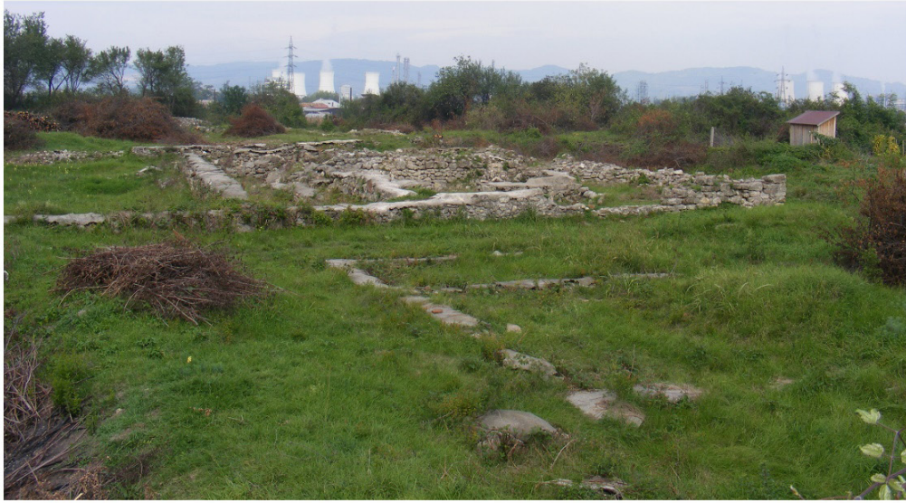
3. STOLNICENI SITE- ROMAN BATHS