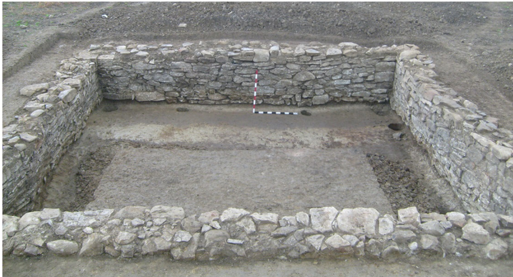
4. OCNIȚA-Downstream from the Dam SITE -L 12