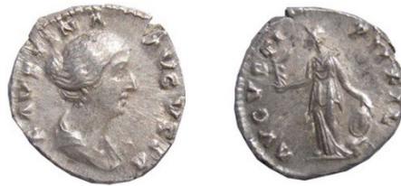
5. OCNIȚA-Downstream from the Dam SITE - FAUSTINA II COIN