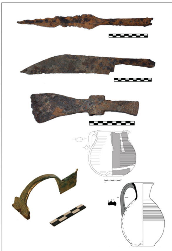
Fig. 4. Finds and fibula from Miraka