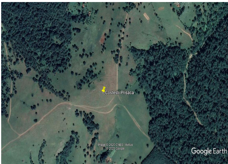
Fig. 3. The Prisaca garrison location, nowadays (Google Earth).

The odyssey of this hoard – circumstances of discovery, the absence of any information on the missing coins, the way it was split – does not allow further numismatic comments based on statistics. However, it is certain, that we are dealing with another hoard buried and not recovered during the Dacian wars. Similar hoards have been already well-documented in the area surrounding the Dacian kingdom center from Sarmizegetusa Regia (fig. 4). The most recent discovery is the small deposit of six denarii ending with a Trajan's coins of AD 101-102 found in a Roman edifice within the precinct of Sarmizegetusa Regia. 17