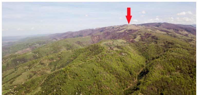
Fig. 2. Drone photo, alt. 967 m, above the Costești-Cetățuie hillfort looking towards the Prisaca Hill. To the left the River Mureș Valley.

The discussion with one of the finders also revealed that the hoard was found on the inner side of the fortification's northern limit.