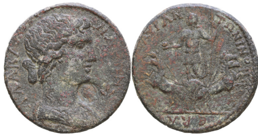
Fig. 3. Alabanda coin