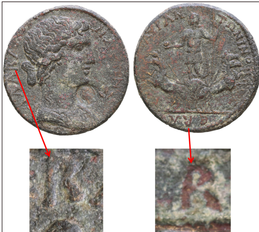
Fig. 5. Detail of the letter “B” on the obverse and reverse of the coin.