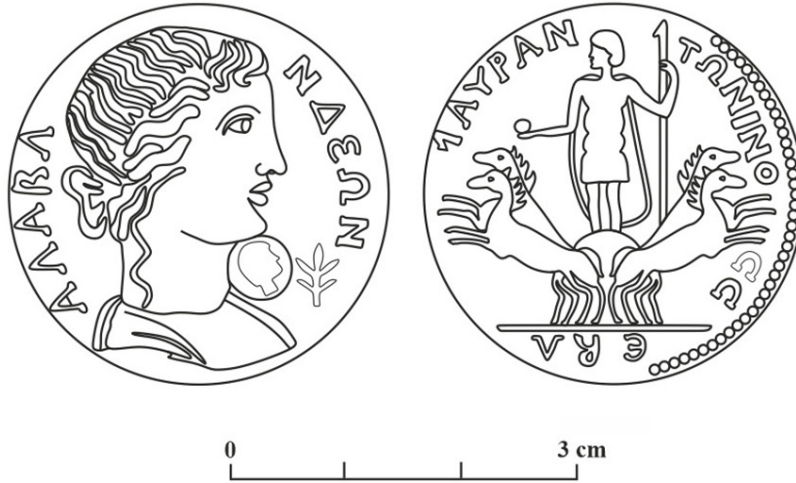
Fig. 4. Drawing of the coin (R. Gören).