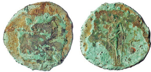
16. Sestertius; OR ⚡ 18.29 g 30.4×32 mm.

Obv. Legend illegible; Bust of Trajan, laureate, draped, right.