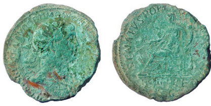
13. Dupondius; OR ⚡ 6.45 g; 24.6×26.2 mm.

Obv. IMP CAES NER TRAIANO OPTIMO AVG GER DAC...; Radiate bust of Trajan, with bare chest, right, wearing aegis on left shoulder.