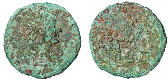
17. Sestertius; OR ↓ 23.08 g; 33.2×34.1 mm. Probably MJIAP 34-35000.

Obv. ... AVG GER DAC PARTHICO ...; Bust of Trajan, laureate, draped, right.