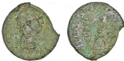
14. Dupondius; AE ⚡ 7.29 g; 22.8×25.8 mm.

Obv. IMP CAES NER TRAIANO OPTI[MO AV]G G[ER DAC PARTHICO] PM TR P COS VI P P; Bust of Trajan, radiate, draped, right.